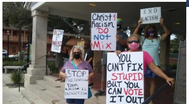
TCCR Staff Photos

On August 30, 2020, protestors of the Communist and the Patriot persuasion appeared in the historic district of St. Augustine, Florida. The Communists were scheduled from 11:00 AM to 1:00 PM. And the Patriots scheduled their activity from 1:00 PM to 3:00 PM. The demonstrations took place on the northeast corner of the Plaza De La